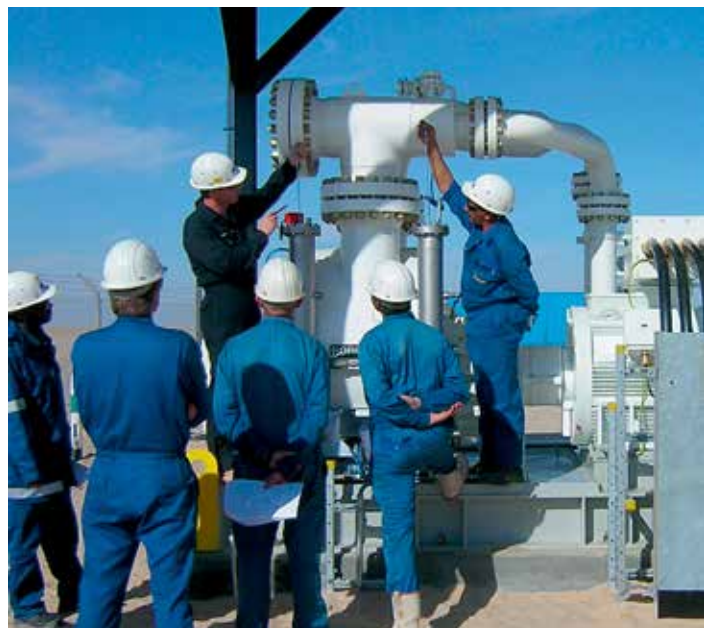
Quality service guarantees your investment