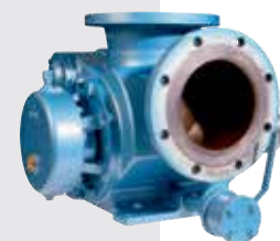
HC/VHC high capacity pump