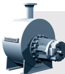
MSL single well multiphase pump