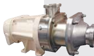
SLH hygienic pump