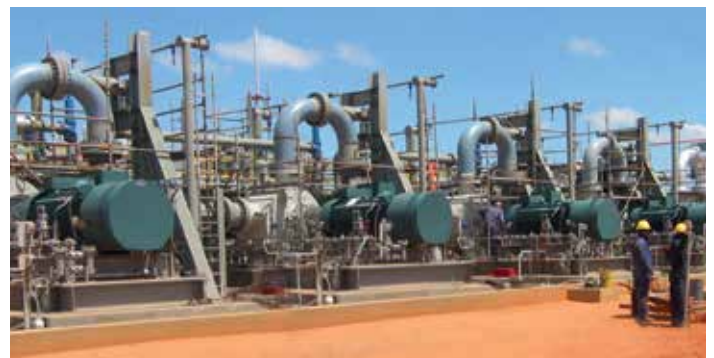
Nearly 80 pumps in operation

Low to very high viscosity oil products such as bitumen, tar, chemicals, light and heavy fuel oil, mazut and storage water.