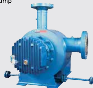
HP high pressure pump