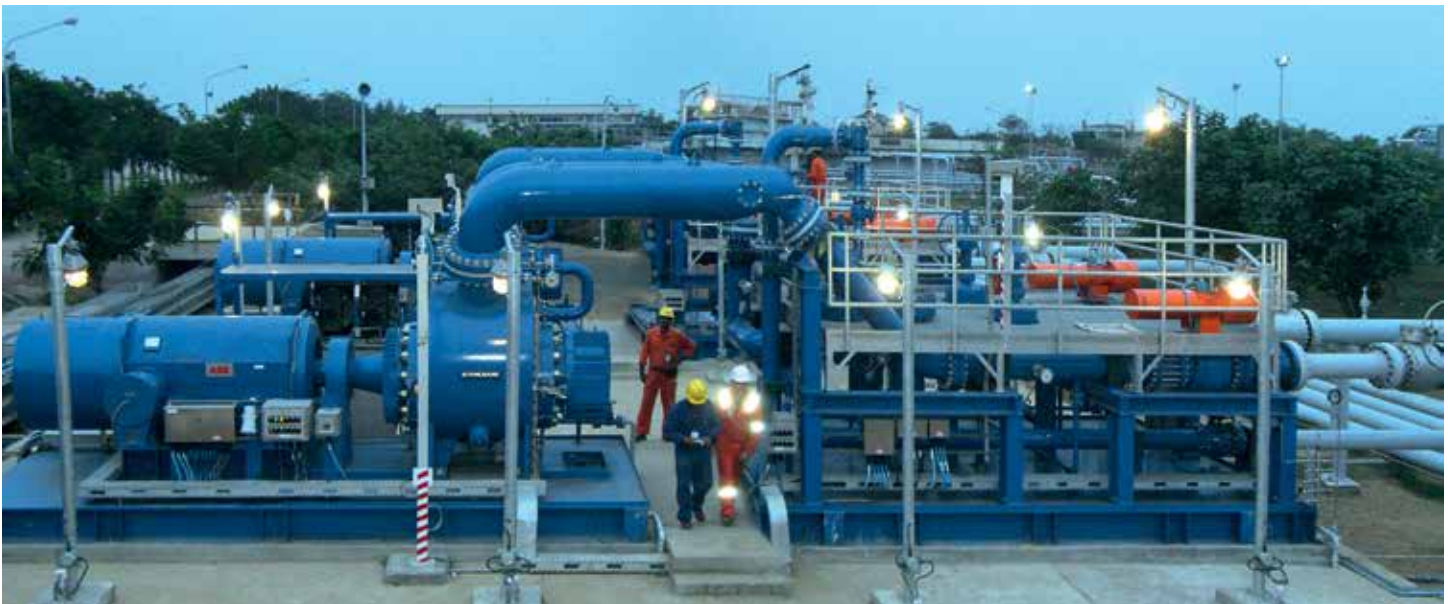
Onshore Terminal in India

Another important factor in ITT Bornemanns success are our employees, whose dedication and qualifications are constantly being cultivated. Environmentally-friendly manufacturing combined with an above-average occupational health and safety policy for employees at all our facilities are vital to the ITT Bornemann culture.