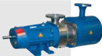
SLM single line multiphase pump