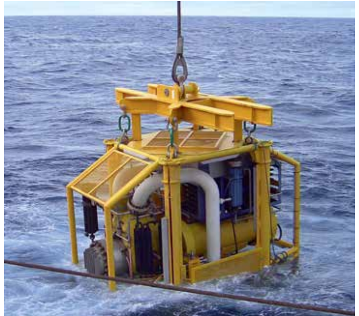
Subsea – the resources are in the ocean

With experienced specialists, the ITT Bornemann logistics team handles the complete shipment of all products worldwide and is also responsible for the import of all purchased products from consumables through to machines.