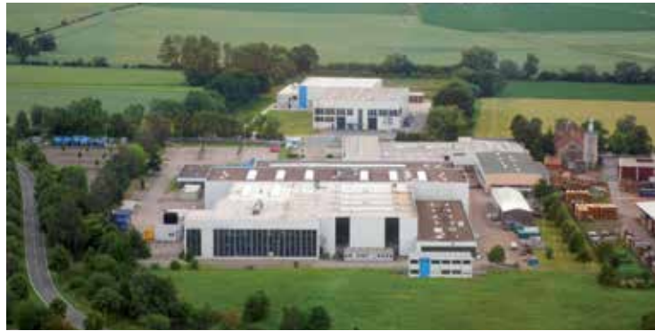
Germany – Headquarter

ITT Bornemann GmbH 31683 Obernkirchen Germany Tel: +49 5724 390-0 Fax: +49 5724 390-290 info.bornemann@itt.com www.bornemann.com