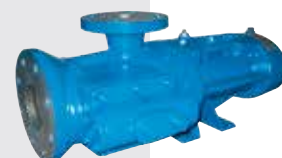
SLI compact pump