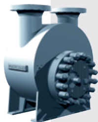
MPC multiphase pump compressor