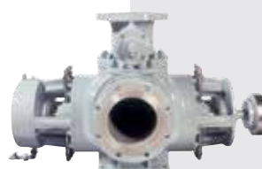
W/V universal pump