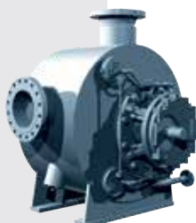
MW classic multiphase pump